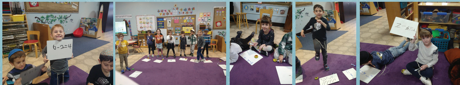
Kindergarten is learning subtraction. In this lesson, the children wrote math sentences on dry erase boards. After figuring out the answer, they had movements to do as many times as the number of the answer!