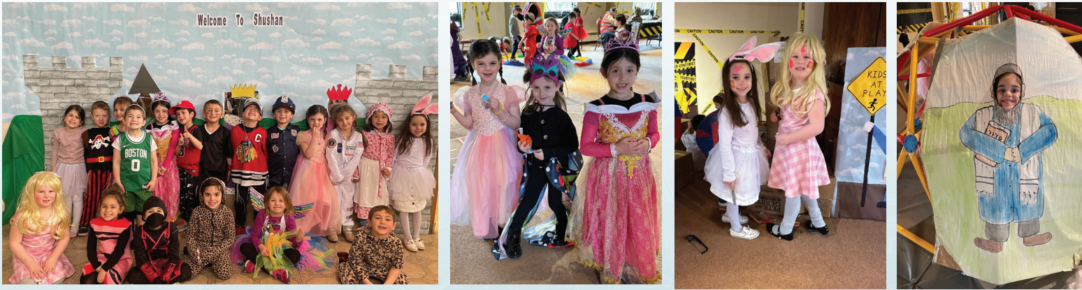
The Kindergarten Yeladim had a super fun Shushan Purim. Not only did they have a blast at the carnival but they got the opportunity to go on a REAL dump truck and speak with and ask A LOT of questions to the firemen about their fire engine.