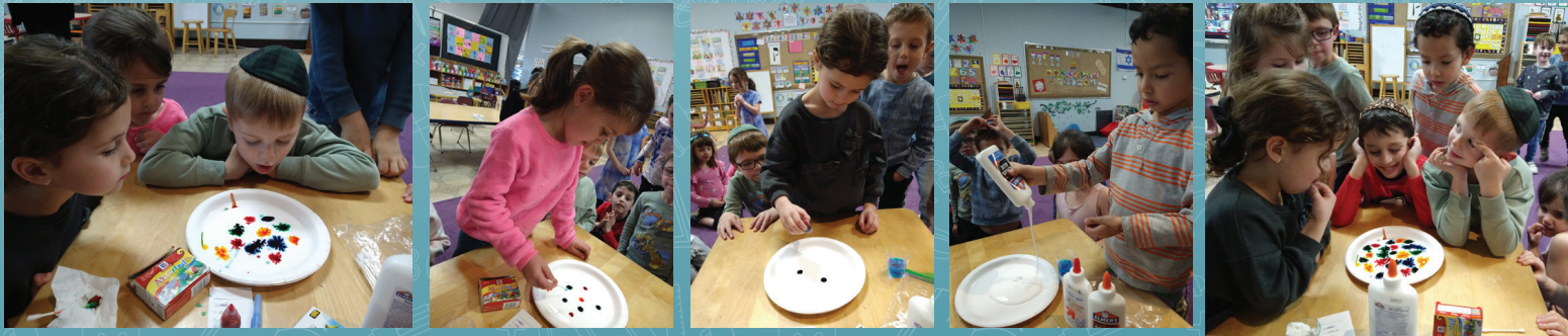
Connecting with the 'ue' sound that they learned this week, the kindergarteners experimented with glue! They dropped food coloring on a plateful of glue, then added a drop of dish washing soap on the colorful dots. The colors spread making beautiful designs!