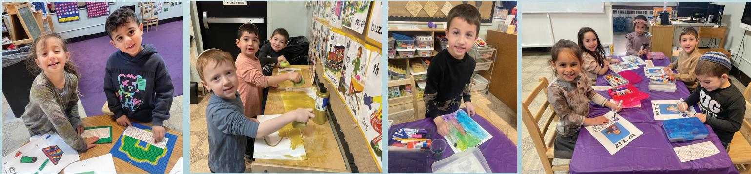
The Pesach learning has begun! The Kindergarteners have begun their Haggados and learning the Mah Nishtana. They are certain to be ready for the Sedar!