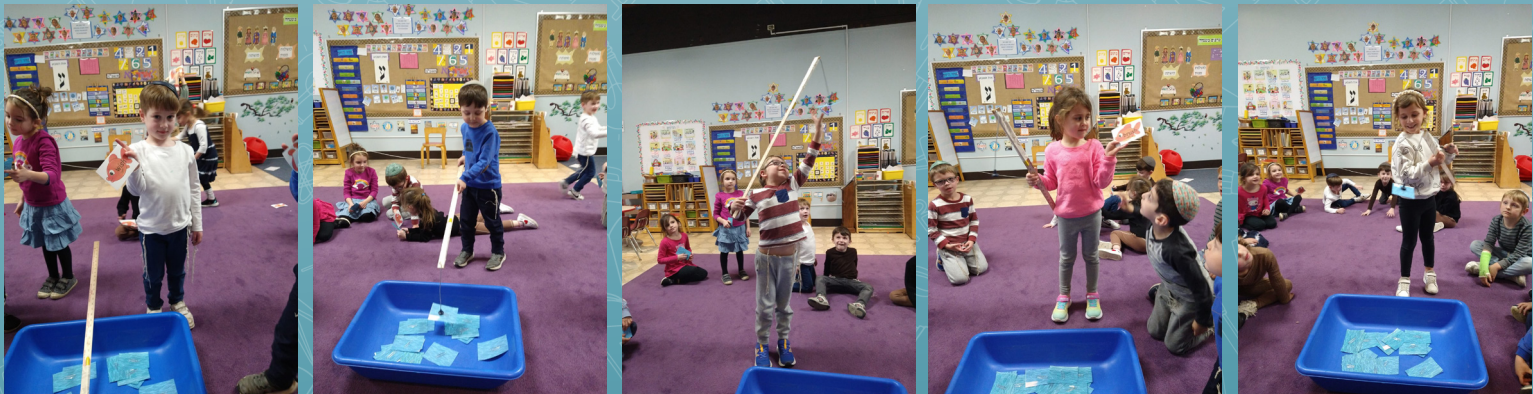
Fishing for 'sh' words was a great reading game!