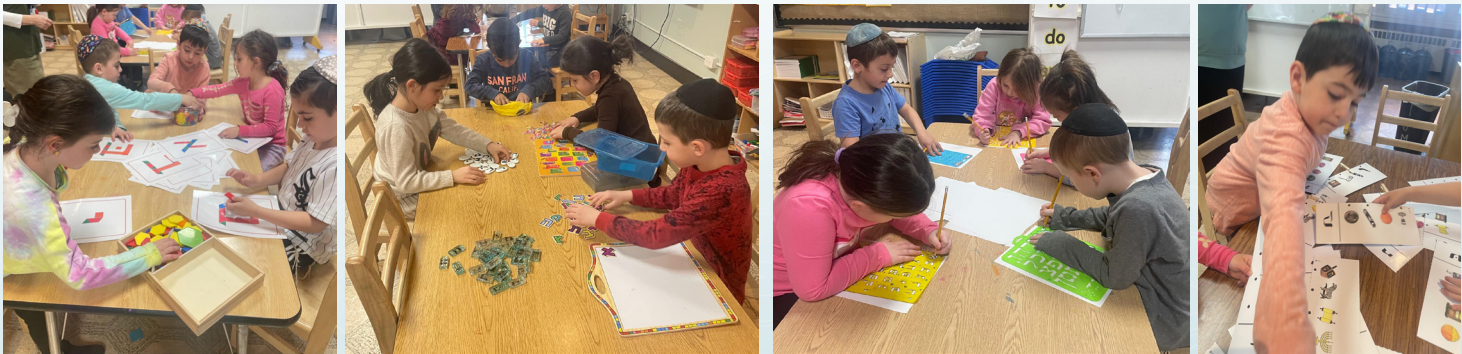
The Kindergarten Yeladim reviewed their Aleph-Beis by doing a “Round Robin.” Whether it was placing mosaic tiles in the shapes of the Aleph-Beis, using stencils to write the letters, placing tiles in the correct Aleph-Beis order or figuring out the beginning letter sounds in words, a great time was had by all.