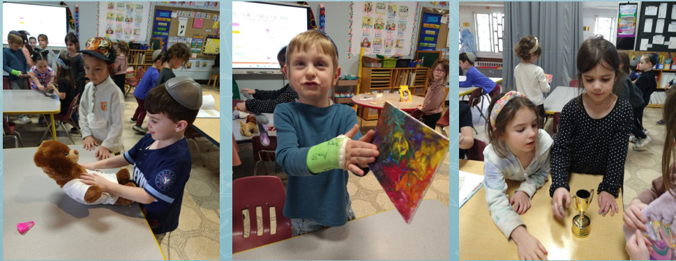
For this week's sound 'sh' the Kindergarteners had a special Show and Share where they showcased the special items they brought to our Show and Share Museum.